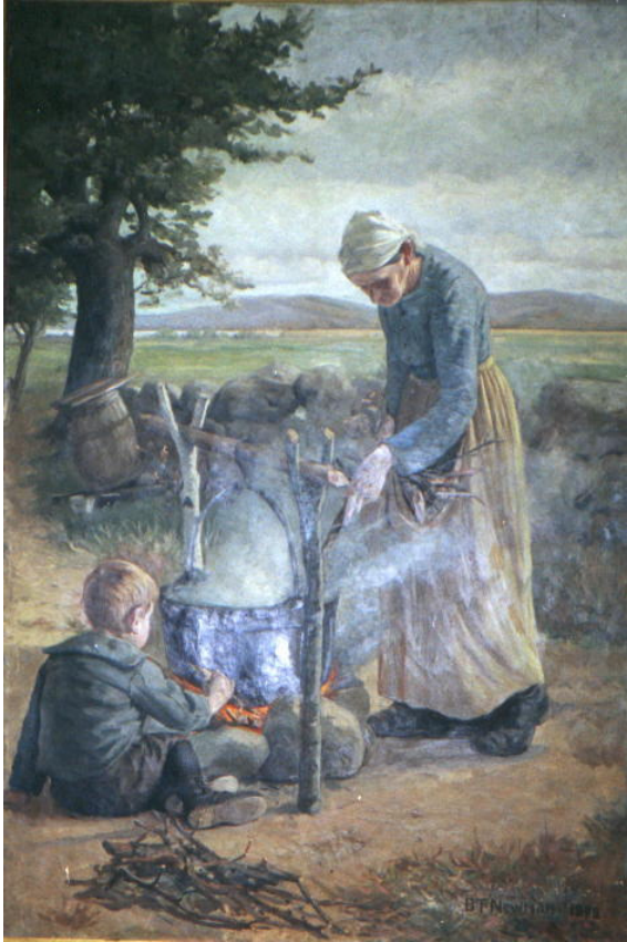
"The Soap Maker"